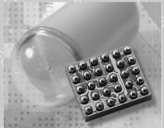
Figure 2: Zarlink's breakthrough ultra-low-power wireless technology is used by Given Imaging in the world's only swallowable camera capsule, measuring just 26 mm x 11 mm. Zarlink's transmitter chip relays camera images as it passes through a patient's gastrointestinal tract.